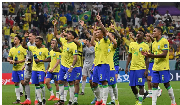
Brazil players celebrate after they won the Qatar 2022 World Cup Group G football match between Brazil and Serbia.

South Korea captain Heung-Min Son played with a face mask after suffering a fractured eye socket earlier this month, but the Tottenham Hotspur forward