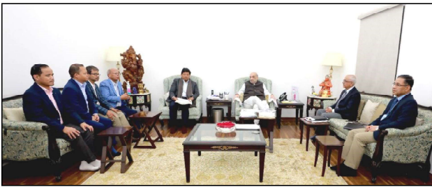
Agency New Delhi, Nov 25:

Union Home Minister Amit Shah on Thursday assured that Meghalaya Chief Minister Conrad Sangma to conduct a CBI probe into the Meghalaya-Assam border clash in which six people were killed.